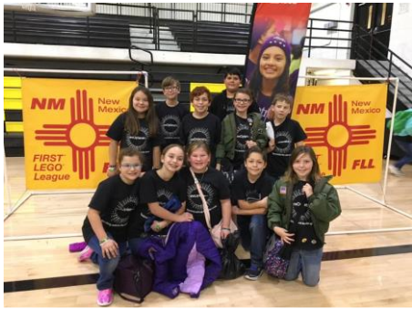
Congratulations to our LEGO League Team, the Ex0planets, they are State Qualifiers!