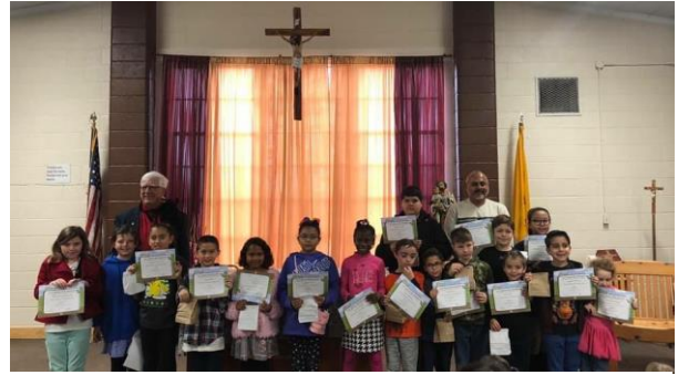
Second Quarter Awards Ceremony Congratulations to our BUG recipients!